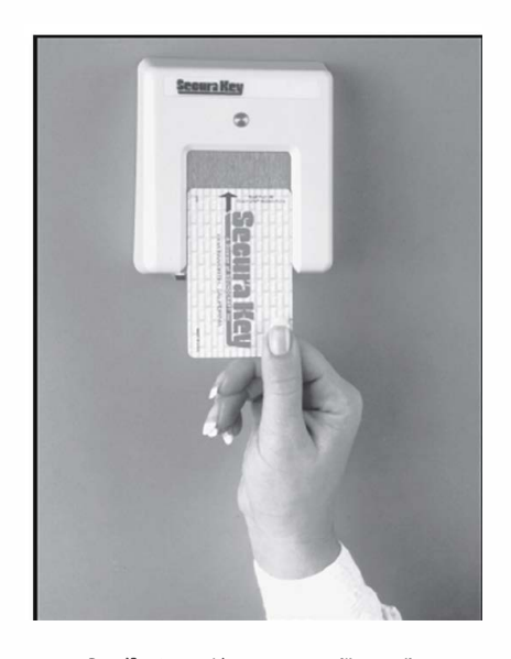
Specifications subject to change without notice © COPYRIGHT 2005